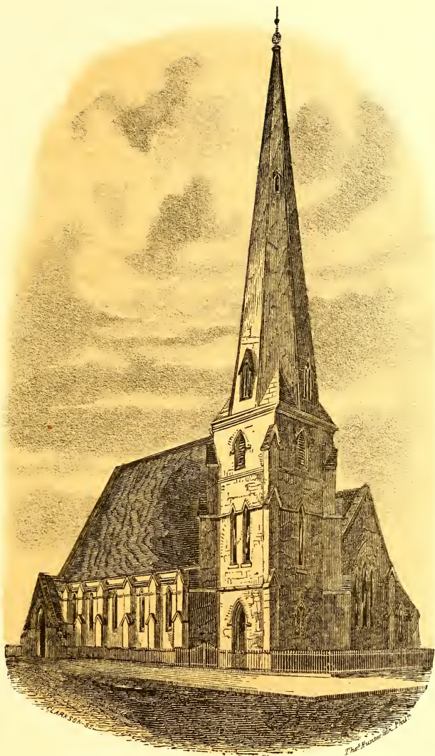
CALVARY MONUMENTAL CHURCH.